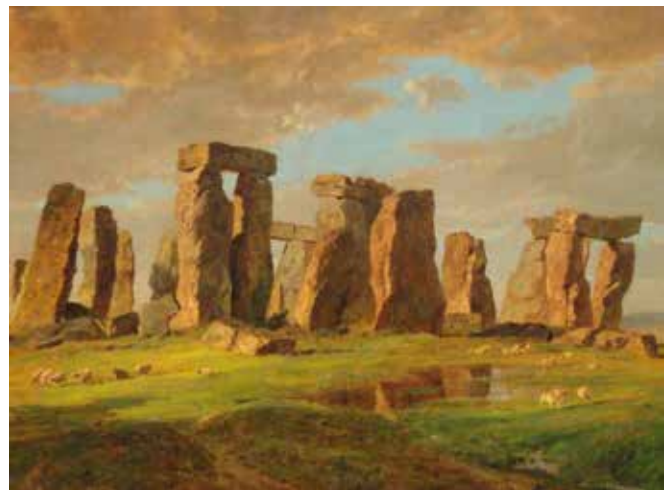
Stonehenge by Jasper Francis Cropsey, 1876