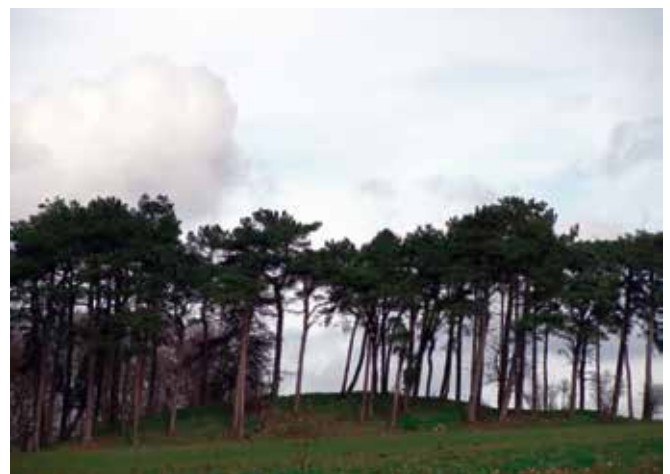
Crippets Cotswold Severn Long Barrow

And there in a nutshell is one of archaeoastronomy's central issues. It can take a while to get one's head around