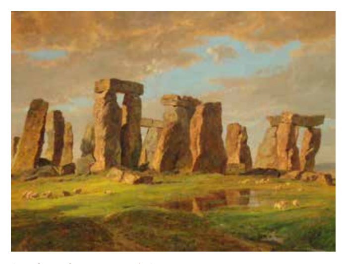
Stonehenge by Jasper Francis Cropsey, 1876

Hawkins and Thom faced considerable opposition to their theories, and even today scholars seem to be highly divided about giving credibility to their pioneering works in archaeoastronomy. The most severe criticism of Stonehenge